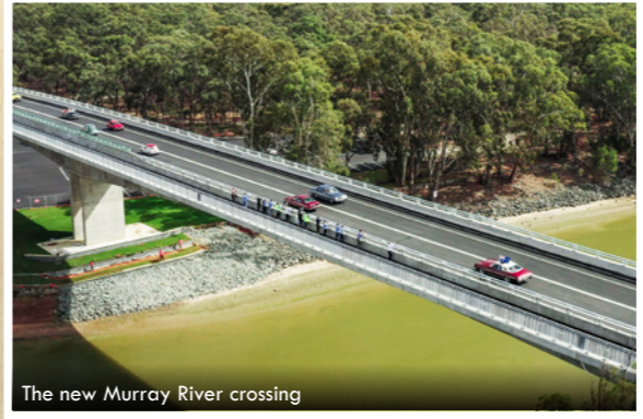
The new Murray River crossing