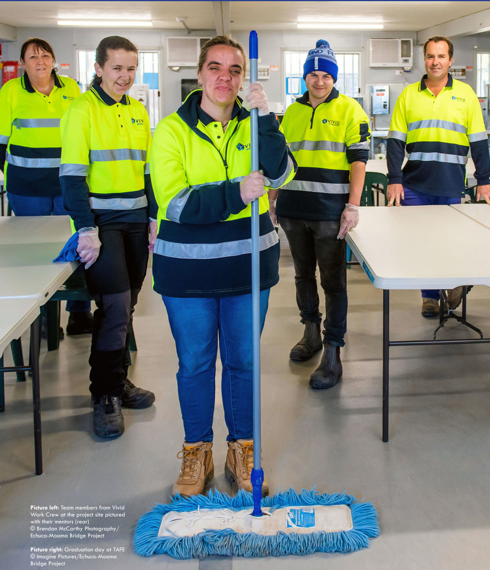
Picture left: Team members from Vivid Work Crew at the project site pictured with their mentors (rear)

Echuca-Moama Bridge Project feature continues over page