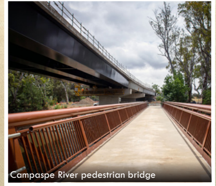
Campaspe River pedestrian bridge