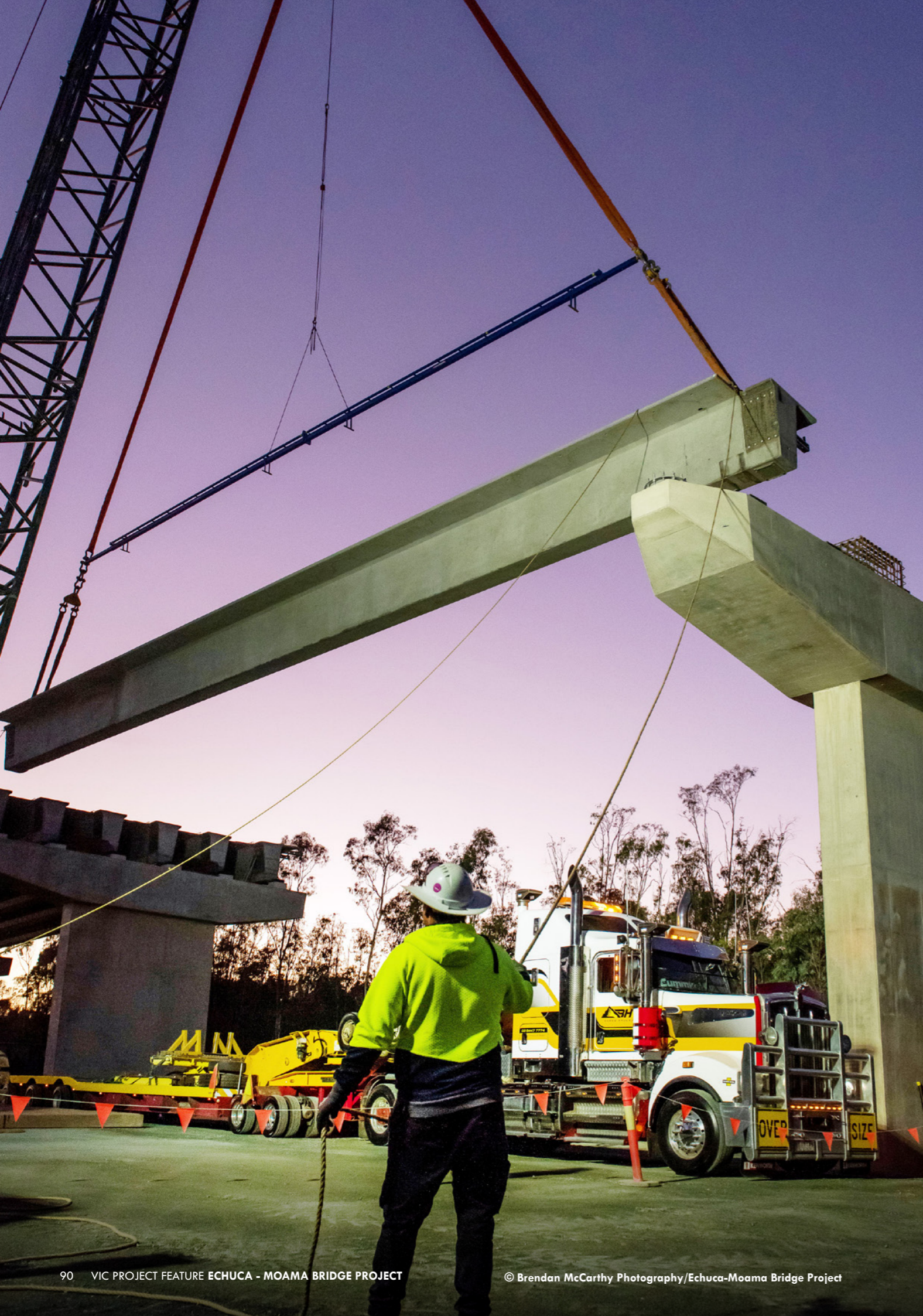
Below The Echuca-Moama Bridge Project, Stage 3, utilised Permadec's GRP (glass-reinforced plastic) panels as a permanent formwork solution.